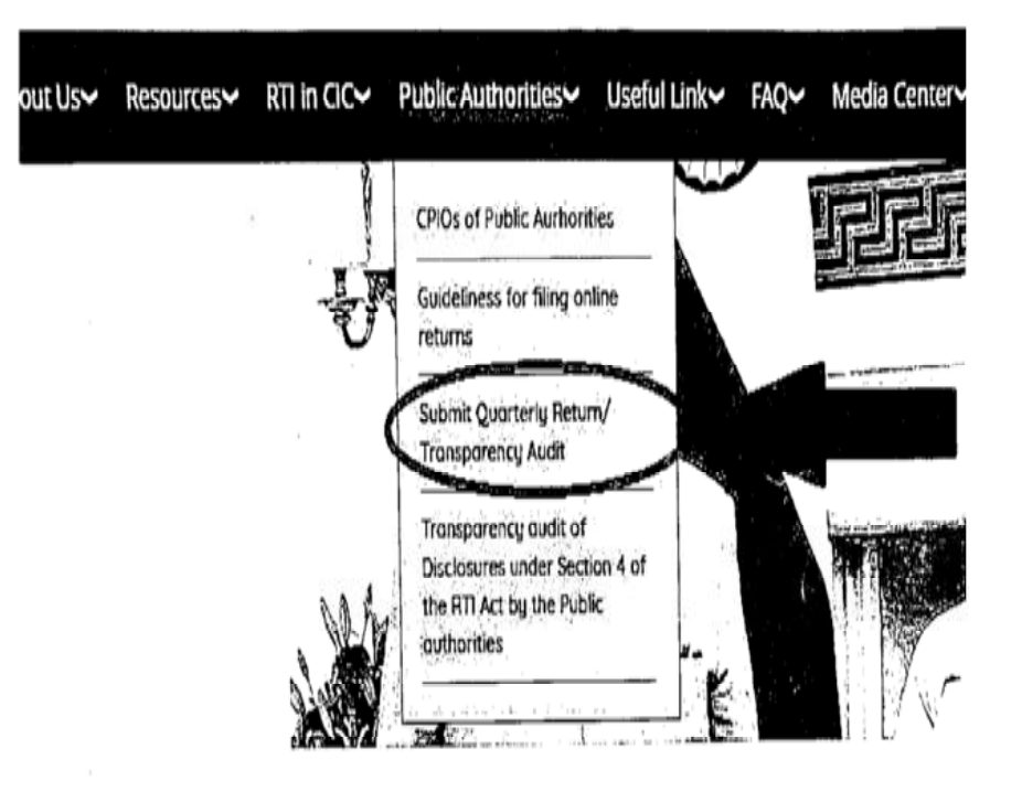
ô ô ô ô